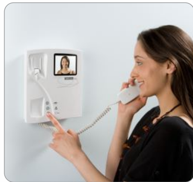
Video door phone for security