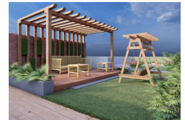
Artistic Image Terrace Garden