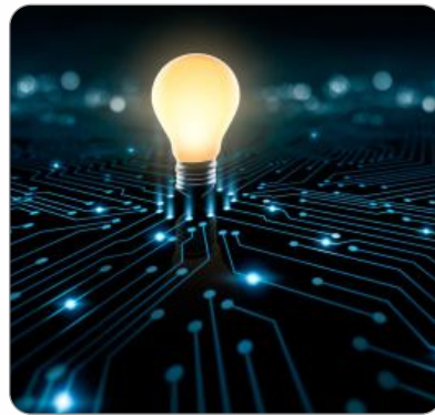
24x7* Power Backup & Water Supply