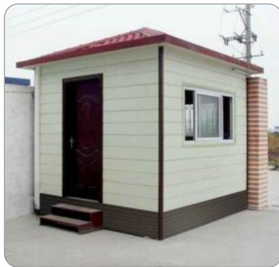
Guard Room & Store/Servant Room