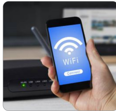
Wi-Fi Enabled Smart home & Common DTH