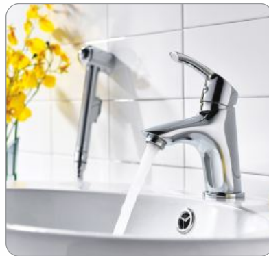
Jaquar Brand bathroom fitting's