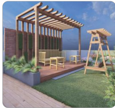
Terrace Garden at top