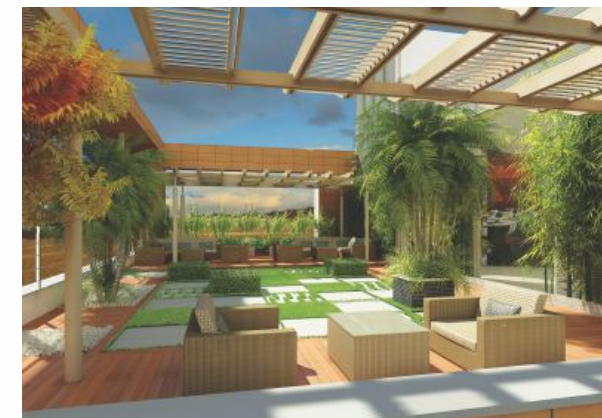
Terrace Garden Artistic View

Ceremony Luxa floors are to be built with meticulousness and inimitable features, Luxa Floors are just for the chosen few. A state of the art project, Ceremony Luxa features spacious rooms, stylish balconies, 24x7* power backup, modern lift, terrace garden, modular kitchen, intercom facilities, guard room, Stilt car parking, wi-fi enabled smart home, wardrobe room and a lobby that offers solace and comfort beyond compare.